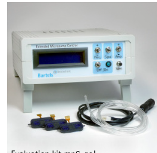
Evaluation kit mp6-go!

For small scale applications in a laboratory environment, standard evaluation kits including fully adjustable driving electronics are available. With its USB interface it allows use in a LabVIEW or other software environment. For more customized applications, miniaturized driving modules are available, which can be easily implemented into an existing system electronics. As the low power consumption allows battery use, all components can be placed inside the incubator chamber.